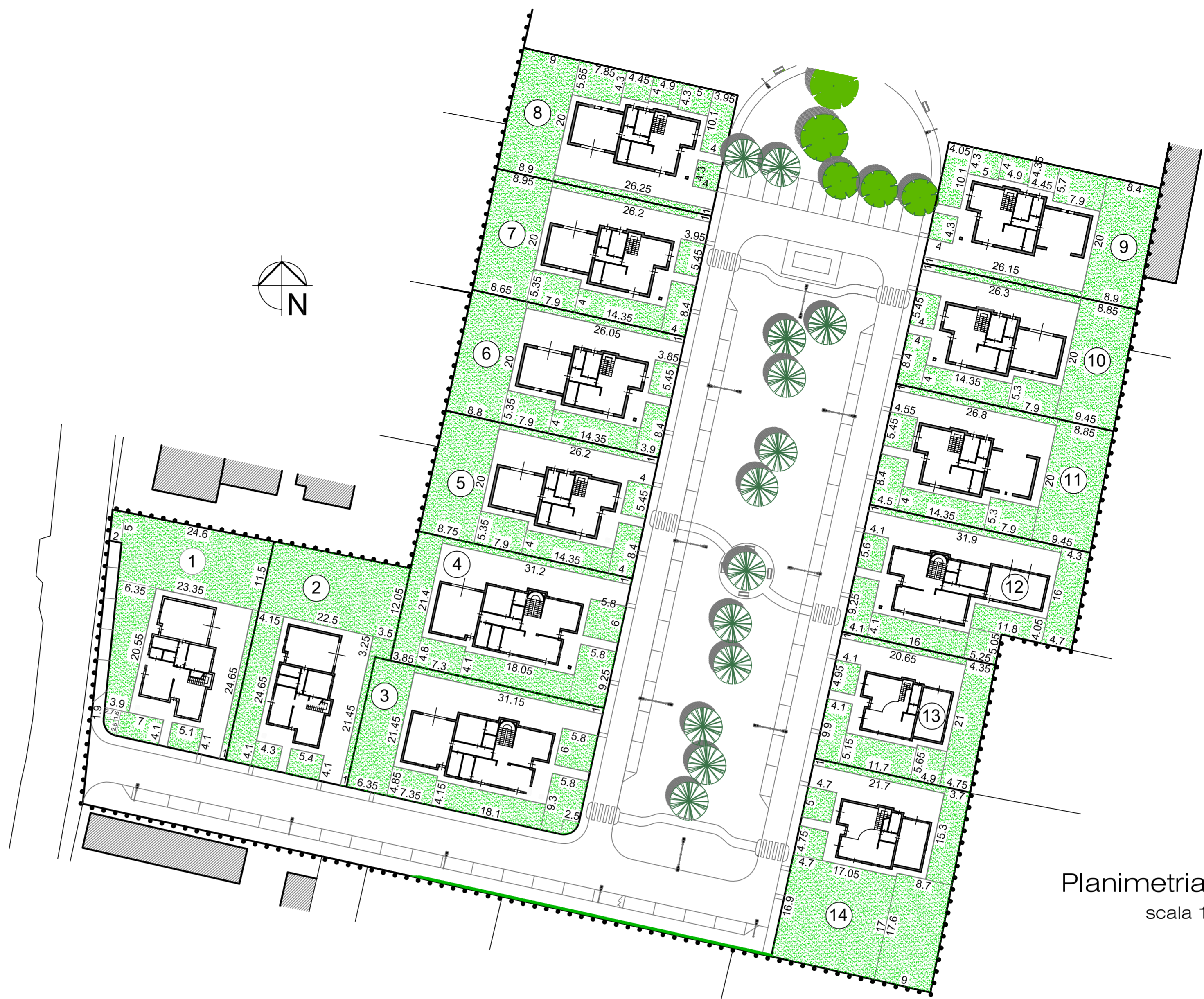
Planimetria generale scala 1:500